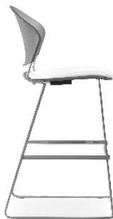
Jet | CAFE STOOL