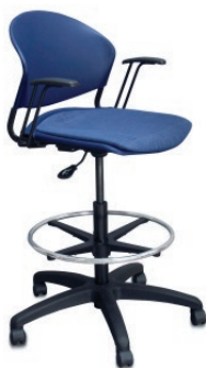
Jet Stool | DRAFTING HEIGHT, UPHOLSTERED SEAT