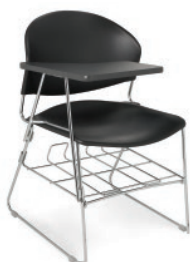
Jet | TABLET ARM + BOOK RACK