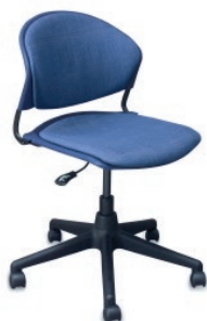
Jet Task | UPHOLSTERED SEAT AND BACK