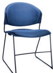
Jet Stacker | UPHOLSTERED SEAT AND BACK