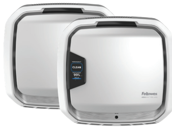
Fellowes AeraMax Pro AM3 and AM3 PC Air Purifier

22.6" h x 14" w x 4.1" d 150-250 sq ft. coverage* 3 Year Warranty 10.6 lbs. | 1.4 amp