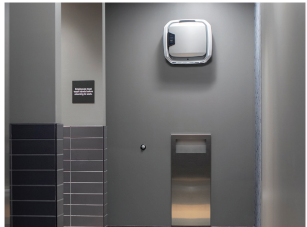
Wall Mount for maximum productivity

AeraMax Pro was designed to seamlessly integrate into your space, whether on the floor, wall-mounted or recessed into the wall. All models are unobtrusive and aesthetically pleasing, so you can provide worry-free air purification wherever it's needed the most.