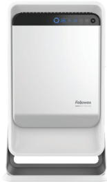
Fellowes AeraMax Pro AM2 Air Purifier

22.6" h x 14" w x 4.1" d 150-250 sq ft. coverage* 3 Year Warranty 10.6 lbs. | 1.4 amp