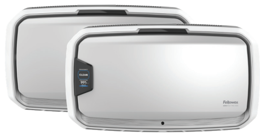
Fellowes AeraMax Pro AM4 and AM4 PC Air Purifier

19.6" h x 20.9" w x 9" d 300-550 sq ft. coverage* 5 Year Warranty 20.2 lbs. | 2 amp